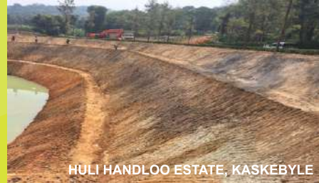
HULI HANDLOO ESTATE, KASKEBYLE