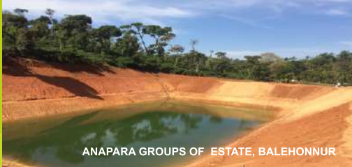
ANAPARA GROUPS OF ESTATE, BALEHONNUR