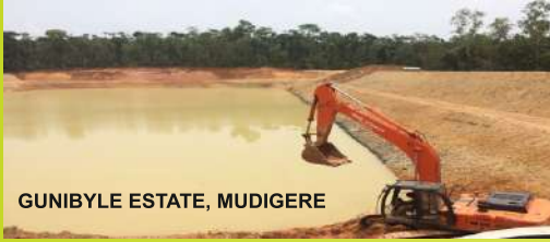
GUNIBYLE ESTATE, MUDIGERE

Specialist in Irrigation Pond & Dam Construction