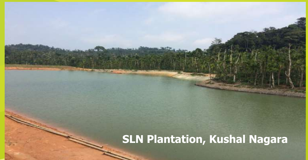
SLN Plantation, Kushal Nagara

When you construct ponds in areas where the soil structure is less suitable, the bund will leak less, if you bring clay from another site and use it to make an inner impervious core.