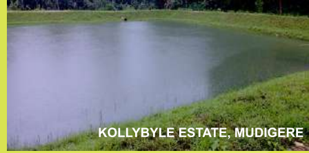
KOLLYBYLE ESTATE, MUDIGERE