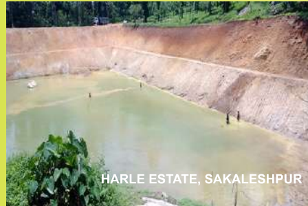
HARLE ESTATE, SAKALESHPUR