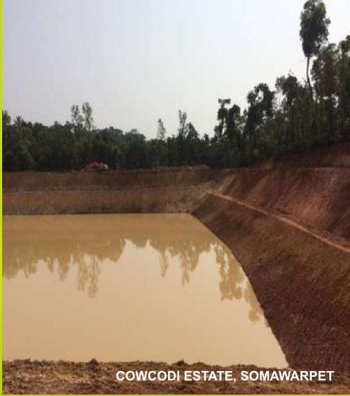
COWCODI ESTATE, SOMAWARPET