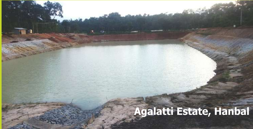
Agalatti Estate, Hanbal

Now that you have decided to have your pond, we are here to guide and construction the pond for you. We guide you on, how the actual construction will be done, incorporating your ideas and suggestions to build a beautiful water garden/pond.