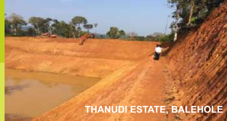
THANUDI ESTATE, BALEHOLE