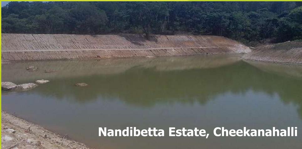
Nandibetta Estate, Cheekanhalli