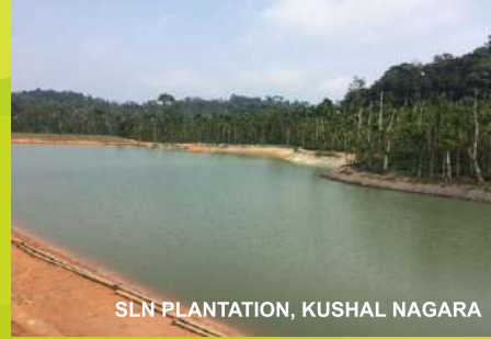
SLN PLANTATION, KUSHAL NAGARA