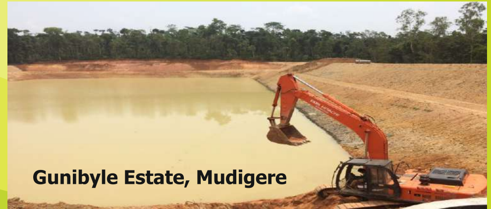
Gunibyle Estate, Mudigere

Specialist in Irrigation Pond & Dam Construction