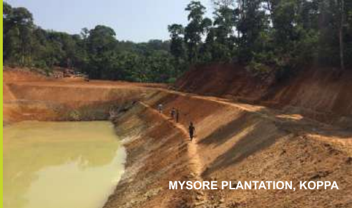
MYSORE PLANTATION, KOPPA